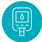
IVD & SELF-DIAGNOSIS